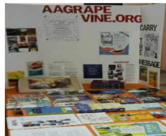
Gretchen E, Madison D20 Display @ Writing Workshop

In the spirit of our Grapevine/LaVina magazine, we have this section for pics of our varied meeting spaces. Share your space! (no faces plz) grapevine@area75.org