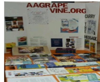
Gretchen E, Madison D20 Display @ Writing Workshop

In the spirit of our Grapevine/LaVina magazine, we have this section for pics of our varied meeting spaces. Share your space! (no faces plz) grapevine@area75.org